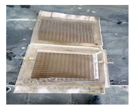
Fig.9: Mud cake when CMC and PAM added.