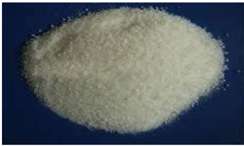
Fig. 4: PAM (polyacrylamide)

PAM is a polymer (- CH_2CHCONH_2 -) formed from acrylamide subunits. It can be synthesized as a simple linear-chain structure or cross-linked, typically using N.N'-methylenebisacrylamide. In the cross-linked form, the possibility of the monomer being present is reduced even further. It is highly water-absorbent, forming a soft gel when hydrated, used in such applications as polyacrylamide gel electrophoresis, and can also be called ghost crystals when cross-linked, and in manufacturing soft contact lenses. In the straight-chain form, it is also used as a thickener and suspending agent