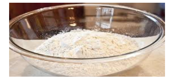
Fig. 3: Xanthan Gum

Xanthan gum is a polysaccharide secreted by the bacterium Xanthomonas campestris, used as a food additive and rheology modifier commonly used as a food thickening agent and a stabilizer (in cosmetic products, for example, to prevent ingredients from separating). It is composed of pentasaccharide repeat units, comprising glucose, mannose, and glucuronic acid in the molar ratio2:2:1. It is produced by the fermentation of glucose, sucrose, or lactose. After a fermentation period, the polysaccharide is precipitated from a growth medium with isopropyl alcohol, dried, and ground into a fine powder. Later, it is added to a liquid medium to form the gum