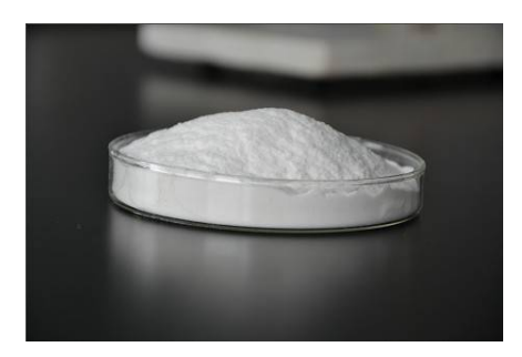
Fig. 5: CMC (carboxymethyl cellulose)

It is also a constituent of many non-food products, such as toothpaste, laxatives, diet pills, water -based paints, detergents, textile sizing, and various paper products.