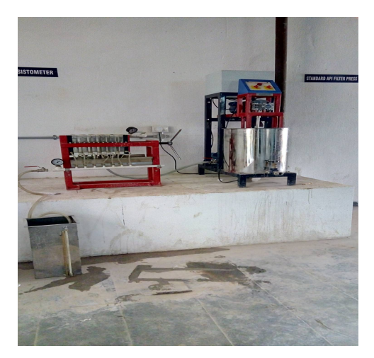
Fig. 1: Filter Press