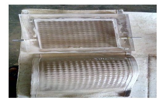
Fig.10: Mud cake when CMC, PAM, and Xanthan Gum.