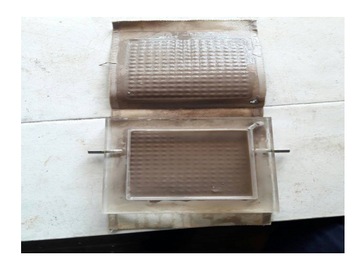
Fig.8: Mud cake when CMC added.