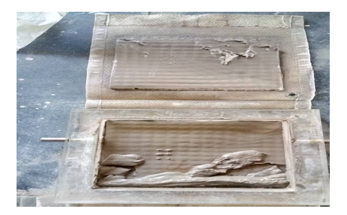
Fig.6: Mud cake of ordinary mud.

8) Now, for every mixture of additives we must carry on the same procedure this is how the result of loss of liquid and cake thickness can be measured.