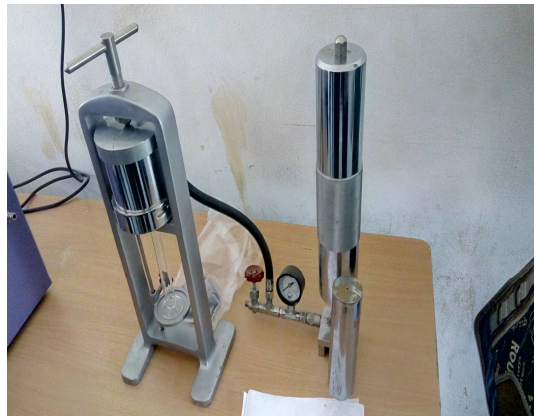
Fig. 2: Filter press

Two plates join together to form a chamber to pressurize the slurry and squeeze the filtrate out through the filter cloth lining in the chamber. It is capable of holding 12 to 80 plates adjacent to each other, depending on the required capacity. When the filter press is closed, a series of chambers is formed. The differences with the plate and frame filter are that the plates are joined together in such a way that the cake forms in the recess on each plate, meaning that the cake thickness is restricted to 32mm unless extra frames are used as spacers. However, there are disadvantages to this method, such as longer cloth changing time, inability to accommodate filter papers, and the possibility of forming uneven cake.